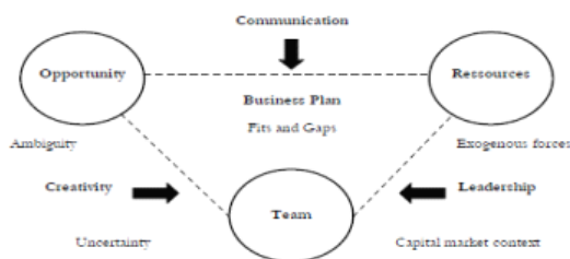
Figure 1. Timmons model of entrepreneurial process (Timmons, 1996).

According to Kirzner (1973), alertness, opportunities and exploitation is a process of entrepreneurial process not creative discovery as suggested by Schumpeter. According to Timmons (1996), there are three important components in entrepreneurial process, these components are useful when starting up a new business, and they include opportunities, resources and entrepreneurial team as seen in figure 1.