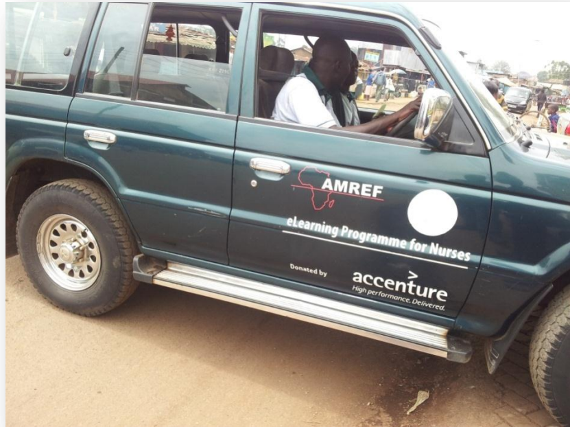
Figure 1: AMREF e-learning programme for nurses. Kibera, Kenya 2011

A visit to AMREF clinic in Laini Saba village in Kibera reveals that in order to reach out the grassroots persons in the slum they do train community health workers (CHWs). These are men and women elected by the community members based on trust; they are then trained in the centre on how to collect data. The majority are illiterate or semi-literate, as such, the mode of their training is done in Swahili mostly using manual papers and markers, slides and play roles to enable them understand.