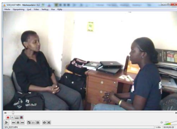
Figure 2: Carolina for Kibera. From video: Hallberg & Wanjira, Kibera, 2011.

In Kenya most of people do not have the reading culture. The preference however is in watching. Therefore, information passed on video would have a greater impact than reading materials. Like having a television tagged on the wall, and patients waiting to be treated can watch clips targeted at passing on important information on health.