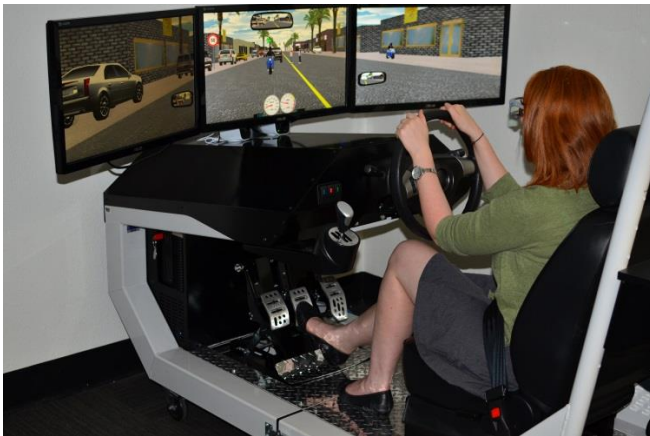
Figure 1: The STISIM Driving Simulator

Each participant completed an off-road driving assessment using the interactive driving simulator located in the Driving Assessment Lab at Curtin University in Western Australia. The Curtin University Driving Simulator is a fixed-base simulator that has mid-level physical fidelity and consists of a driving console and three display screens (see Figure 1). The driving console is made up of an adjustable sedan style seat with acceleration, brake pedals and a fully functioning steering wheel. Driving related auditory feedback, such as traffic and engine noise is provided through the digital auditory output system, therefore providing a more immersive experience. The simulator has previously been validated for use on older adults (Lee, Lee, & Cameron, 2003) and has good reported transference to real-world driving performance (Devos et al., 2009).